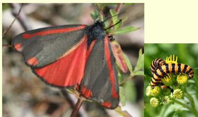
Cinnabar – Tyria jacobaeae

When viewing online, simply click on the species name to find out more.