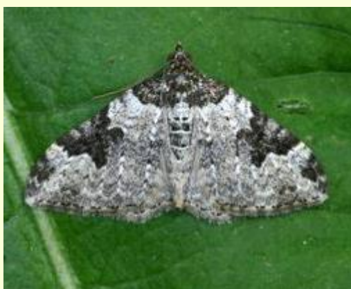
Garden Carpet – Xanthorhoe fluctuata

ID: 20mm. Pale grey with dark patches. Triangular shape.