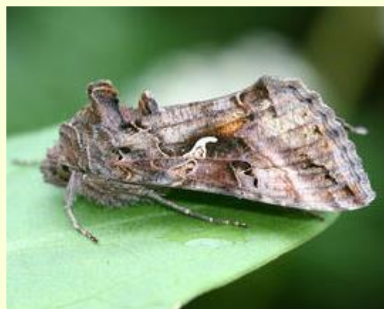
Silver Y – Autographa gamma

ID: 25mm. Brown/grey with a striking silver Y on the forewings. April-September.