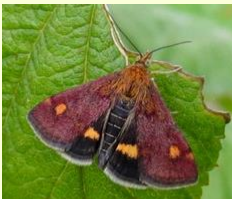
Mint Moth – Pyrausta aurata

ID: 15mm. Red/purple with gold spots. May-August.