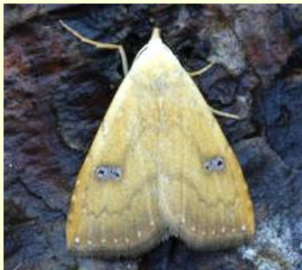
Straw Dot – Rivula sericealis

ID: 15mm. Buff/pale yellow with paired dark spots.