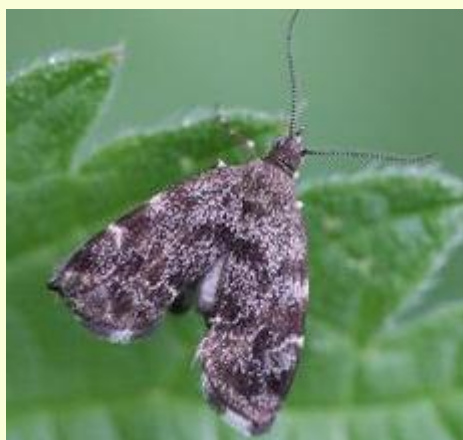
Nettle Tap – Anthophila fabriciana

Similar: Narrow bordered 5-Spot Burnet (5 wing spots)