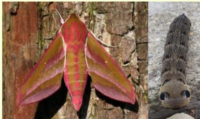
Elephant Hawkmoth – Deilephila elpenor

ID: 40mm. Spectacular pink and brown moth. May-July. Caterpillars to September.