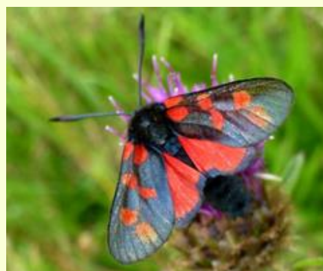
6 Spot Burnet – Zygaena filipendulae

ID: Black forewings with six spots. Hindwings red with black border.