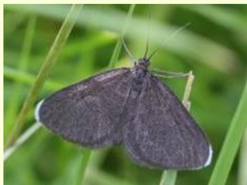
Chimney Sweeper – Odezia atrata

ID: 20mm. Black with white, rounded wing tips.